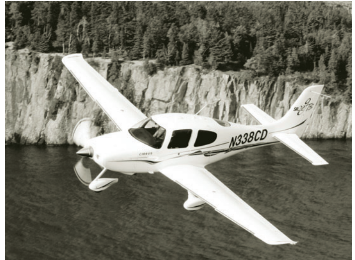
The general aviation industry would be supported by programs at a new Minnesota Center for Advanced Aviation at Lake Superior College in Duluth.

General aviation, representing all aviation except scheduled flights and military aviation, is an industry seeing strong growth even though the commercial airline industry continues to struggle. General aviation makes up 96 percent of all U.S. aircraft and 60 percent of U.S. flight hours. More than ever, businesses and local communities are relying on